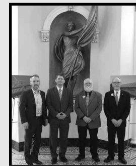
Officials from Geronimo Energy, Basin Electric, Rushmore Electric and West River Electric announced the project Feb. 18 in Pierre, S.D.

Power Purchase Agreement for 128 MW South Dakota Solar Project Geronimo Energy (Geronimo), a National Grid company, and Basin Electric Power Cooperative (Basin Electric) announced Feb. 18 the execution of a Power Purchase Agreement (PPA) for the Wild Springs Solar Project (Wild Springs). Wild Springs is a 128 megawatt (MW) clean solar energy project located in Pennington County, South Dakota, approximately 20 miles east of Rapid City. Wild Springs is anticipated to begin operations in 2022. Using the EPA's greenhouse gas equivalencies calculator, the project is estimated to offset carbon dioxide emissions by 190,000 metric tons annually.