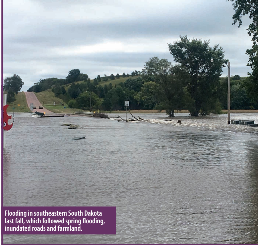
Flooding in southeastern South Dakota last fall, which followed spring flooding, inundated roads and farmland.

With wet conditions last fall heading into the freeze-up, the soils were fairly well saturated as they froze, which will make them much more impervious to soaking up much of the snow melt as it occurs.