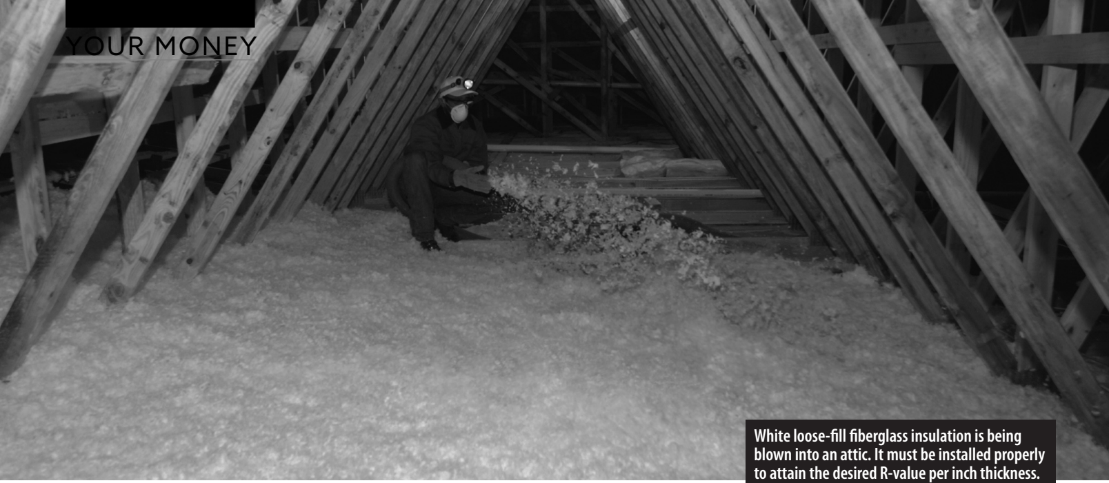
White loose-fill fiberglass insulation is being blown into an attic. It must be installed properly to attain the desired R-value per inch thickness.