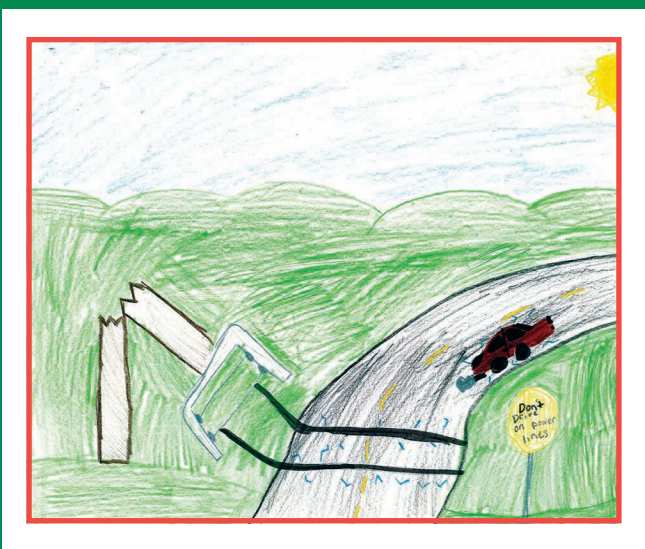
"Don't drive on power lines."