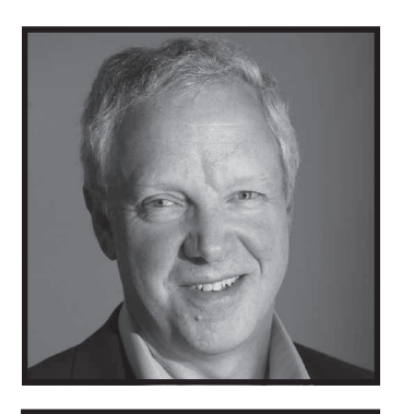
Pat Keegan Collaborative Efficiency

Don't forget to check with your local electric cooperative on additional programs and services designed to help you save on your energy bills.